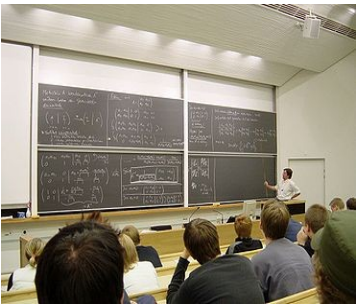
Students attending a lecture on linear algebra at the Helsinki University of Technology

classes. Most of the courses are offered after the school day or seniors